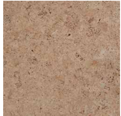
CHAMPAGNE SAND AMBIENT RC-CHAMPSAND