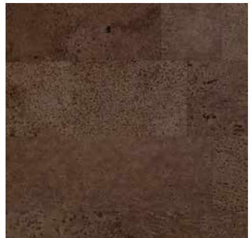
RUSTIC OLIVE AMBIENT RC-RUSTOLIVE