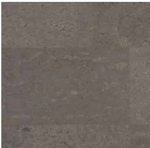
SLATE AMBIENT RC-SLATE