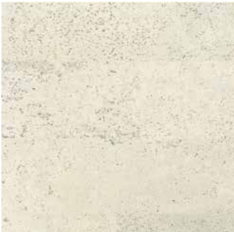
HARMONY FROST AMBIENT RC-HARMFROST

TILE SIZE: LENGTH: 910 MM | WIDTH: 300 MM | THICKNESS: 10.5 MM | 1 BOX: ± 1.64 M 2