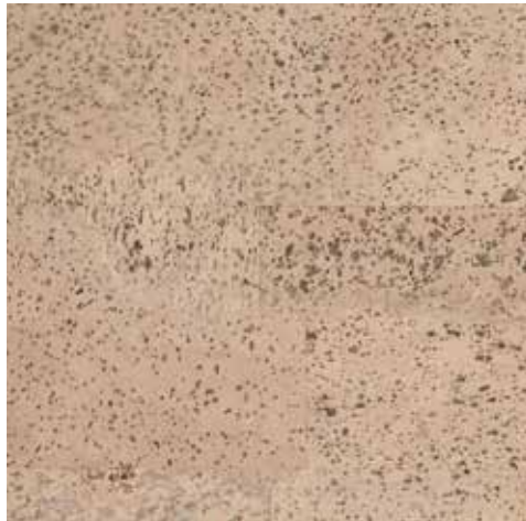
HARMONY IVORY AMBIENT RC-HARMIVORY