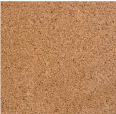
TRADITIONAL AMBIENT RC-TRAD