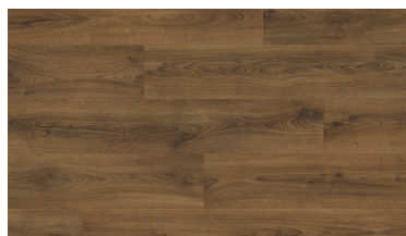
Vintage Brown Oak