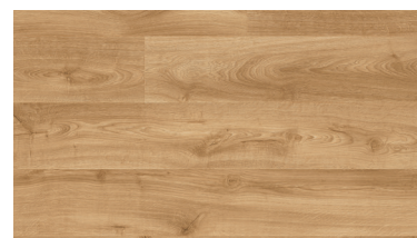
Warm Natural Oak