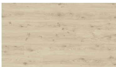
Light Beige Oak