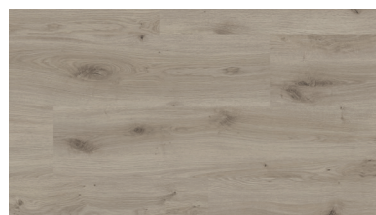
Camel Oak Greige