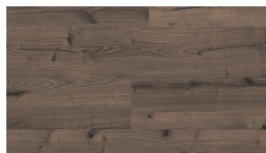
Old World Oak