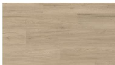
Satin Beige Oak