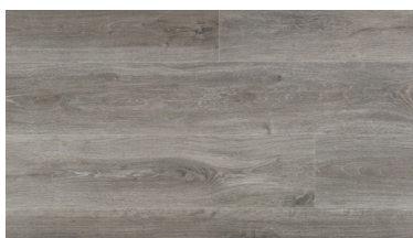
Authentic Oak Light Grey