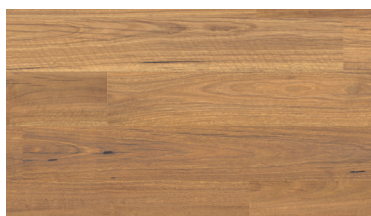
Natural Spotted Gum