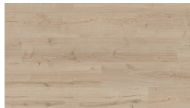
Montana Oak Light Beige