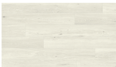
Light Grey Oak

Clix XL radiates elegance and quality, backed by a 10-year waterproof surface warranty. Its extra-long, wide panels beautifully enhance spacious rooms, while the 4-sided pressed bevel adds a touch of genuine craftsmanship. Delicate colour variations between planks create a stunningly natural look.