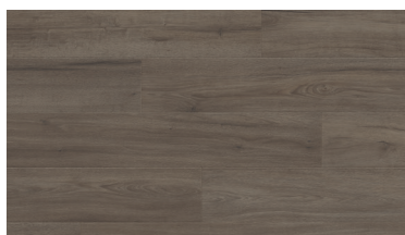
Feather Grey Oak