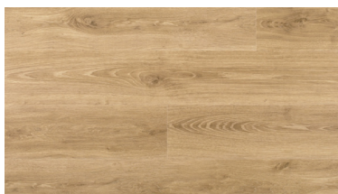
Authentic Oak Nature