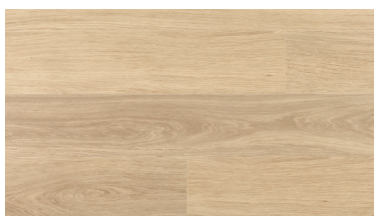
Classic Oak White Varnished