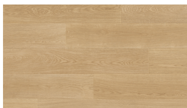
Toasted Almond Oak